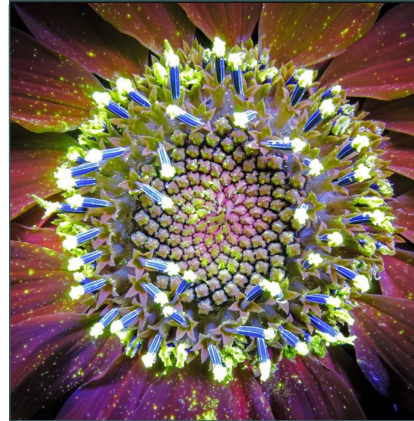
Above: Sunflower under UV light.

CHECKBOOK BALANCE 30 APRIL 2024 10,098.33